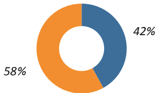
CONTRACT VS. NON-CONTRACT